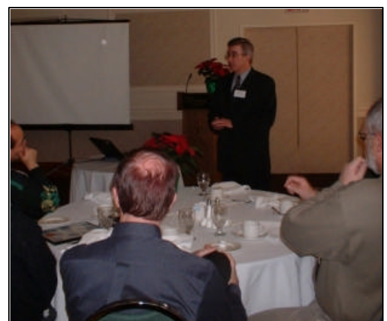
Attendees were delighted to hear an FM success story