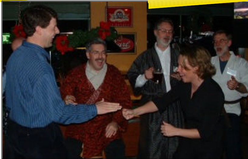
The "BATTLE of YIN & YANG" draws cheers from the Judges