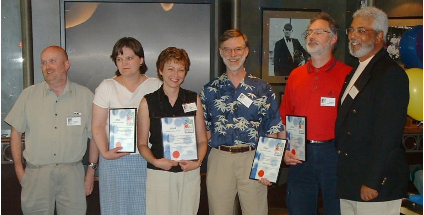
10 year Membership Award Presentation: (left to right)